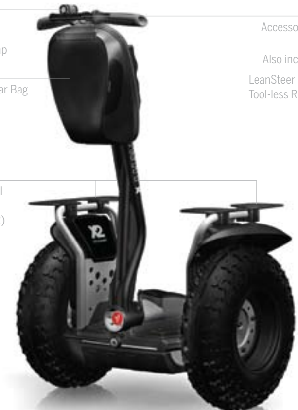
Also included: LeanSteer Frame Tool-less Release