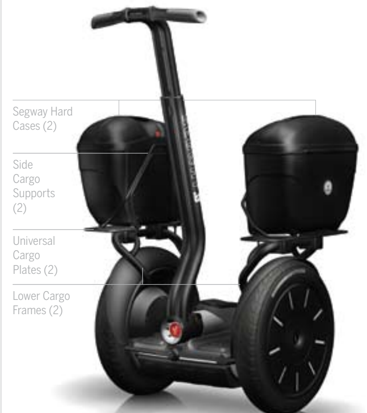
Segway Hard Cases (2)