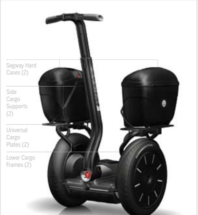
Segway Hard Cases (2)